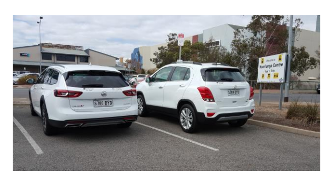
Figure 1: Maven share cars at Noarlunga, SA

No one interviewed knew about car sharing that was available in the city (GoGet cars); or share cars. Two Maven share cars are available for use in a large southern suburban train station and shopping precinct (Noarlunga Centre). Yet, although the centre was well known to all, and in very close proximity to most of those interviewed, no one had noticed these share cars or knew anything about them. In the case of the two available Maven cars they are within easy view on a busy road that is adjacent to the train station and right beside the shopping centre (see Figure 1). However, it is noted that there are no visible signs beside the cars to specifically indicate what service they provide or how they can be accessed (Figure 2) – rather, the signage relates to public transport options. Better street advertising is something that may help people in the area to become aware of Maven. More information delivered to the public may help people ascertain if the share cars may be able to meet some of their own transport needs.