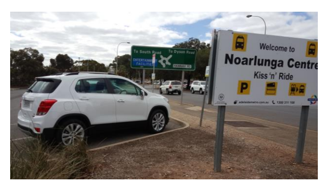
Figure 2: The only sign near Maven share cars

Once the Maven cars were explained to the committed car users, four people did express interest in these types of share cars, and in being given more information about the Maven cars. All four also stated they would like a trial of the cars at some time in the future if this could be arranged. Arranging share car trials was outside the scope of this research project.