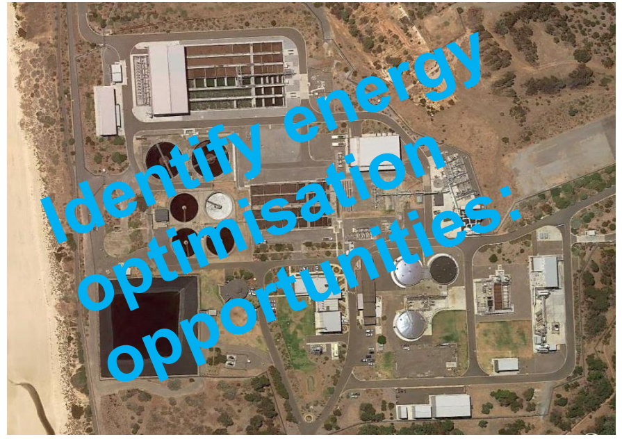
Figure 1: Aerial view of Christies Beach wastewater treatment plant (Adapted from Google, 2014)

This research will address this disparity by developing a new adaptation of the European energy benchmarking approach which is suitable for industry use in the optimisation of wastewater to treatment/water recycling processes in Australia.