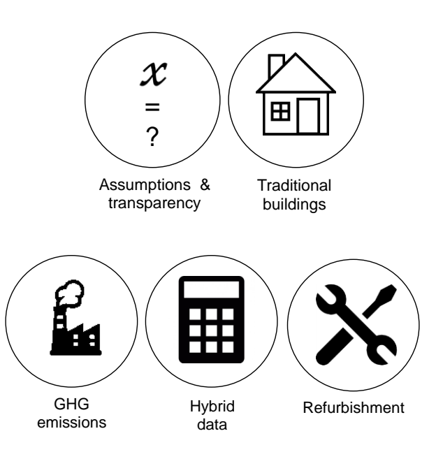
Figure 3: Summary of the limitations of previous LCA and LCC studies

However these measures primarily focus on improving the operational performance of a building, leaving the embodied performance largely ignored. A barrier plaguing the uptake of strategies that decrease both the operational and embodied is the uncertainty towards the financial cost to the developer. Several studies have used Life Cycle analysis (LCA) as a means to assess a buildings energy and GHG performance over the expected lifetime and life cycle cost analysis (LCC) to assess its expected financial performance. However these studies contain several limitations, as illustrated in Figure 3 below, which this research will aim to address.