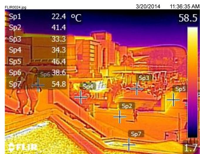
Figure 2. Some urban surfaces such as asphalt, concrete and hard paving store the heat in their thermal mass and make the public space a dangerous place to attend during heatwaves.

Please share your ideas about research promotion and pathways to utilisation.