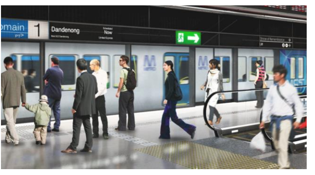
Figure 4: Melbourne Case Study – Melbourne Metro