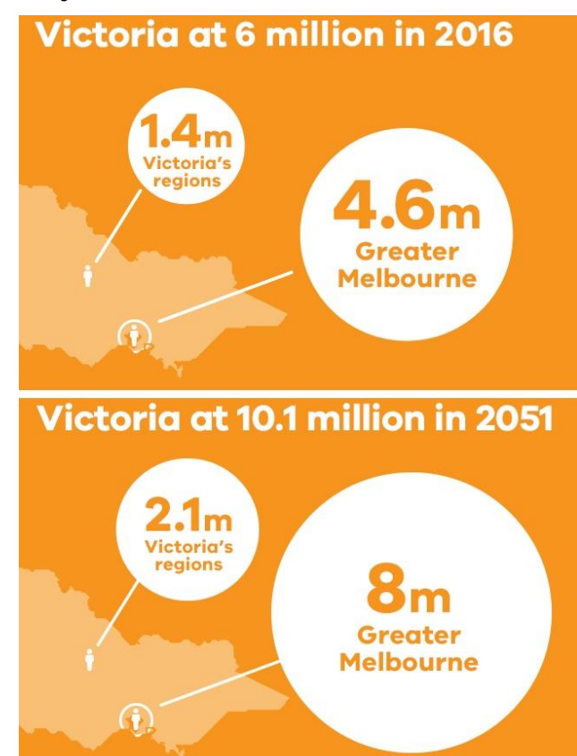
Figure 1: Melbourne's anticipated population growth

For decades transport has been a political football; this trend is set to continue. How do we better understand and interpret transport decisions to achieve 'better' Future City outcomes?