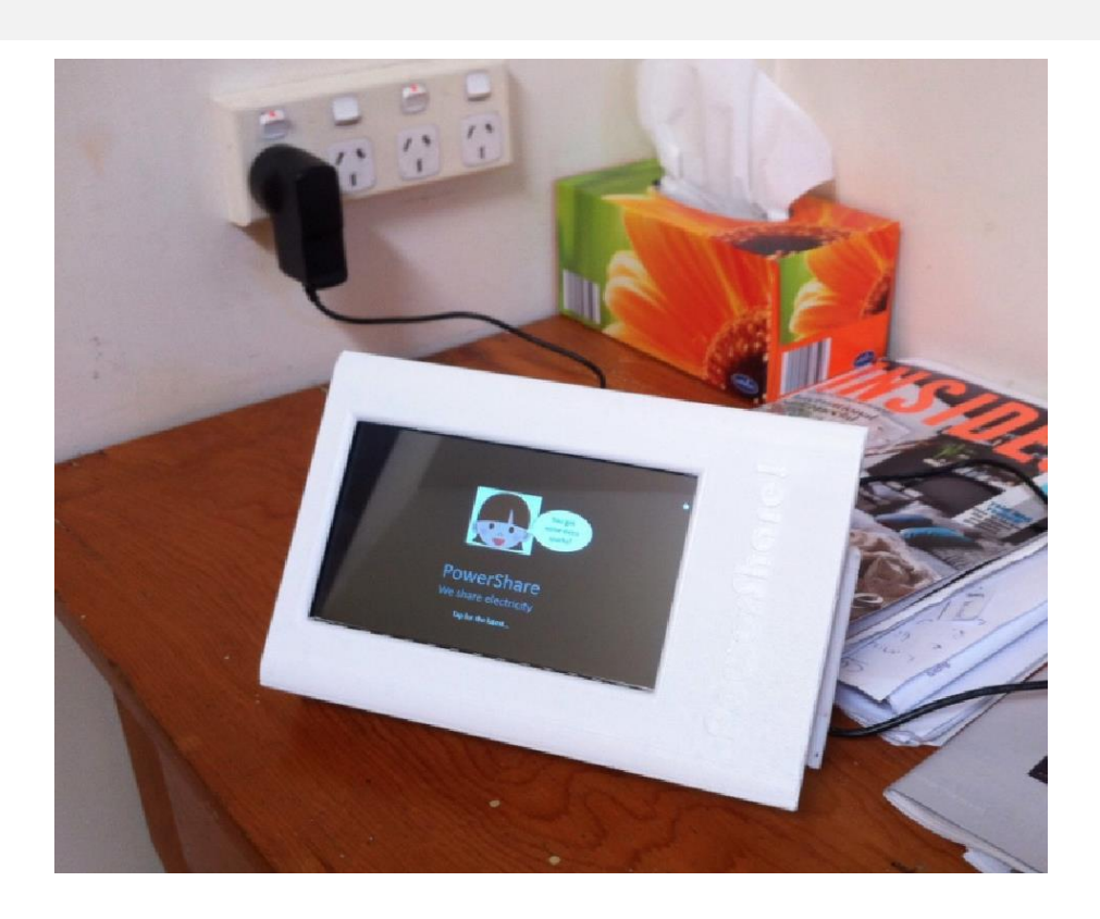
Figure 2: The in-home display is connected to the smart meter as well as data sources such as the Bureau of Meteorology, PVWatts.org and other IHDs

An in-home display (IHD) (Figure 2) has been created and is distributed to homes as a computer display of their energy consumption. Home energy use is captured from smart meters. The IHD is used to selectively display additional information such as consumption relative to the group; over-consumption of (unnamed others) and the ability to apply the social sanctions of a common pool resource (CPR) game.