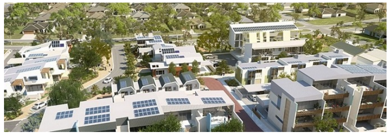
Figure 1: WGV development in Fremantle

Go beyond people's attitudes and values towards living sustainably and see how people's daily practices, routines and habits actually change