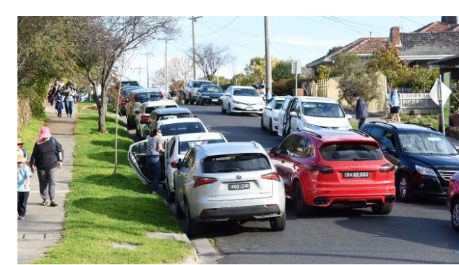
Figure 2: Traffic congestion during school drop off