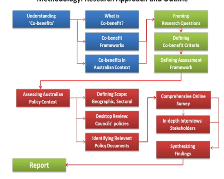
Figure 1: Research Approach and Outline

Methodology: Research Approach and Outline