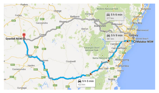
Figure 2: A route for biosolids transportation. Due to community barriers, biosolids must be transported over 350km.

Soon data analysis stage will commence although some preliminary results are available (for example Figure 3).